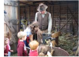
Kids Club Members at the Oliver H. Kelley Farm

The Kids Club welcomes every child and parent who wishes to learn Hungarian and would like to participate. Past events have included Hungarian map "treasure hunt", circle time and Hungarian language class, learning the Hungarian national anthem, making kerchiefs with a Hungarian motif, and visiting the historical Oliver H. Kelley farm. Social time and snacks are also part of the meetings.